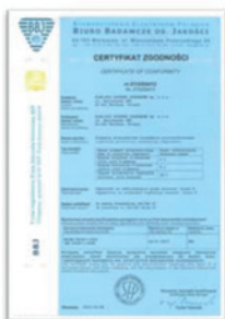
Declaration of Conformity with PN-EN 62561