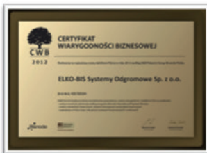
Certificate of Business Credibility